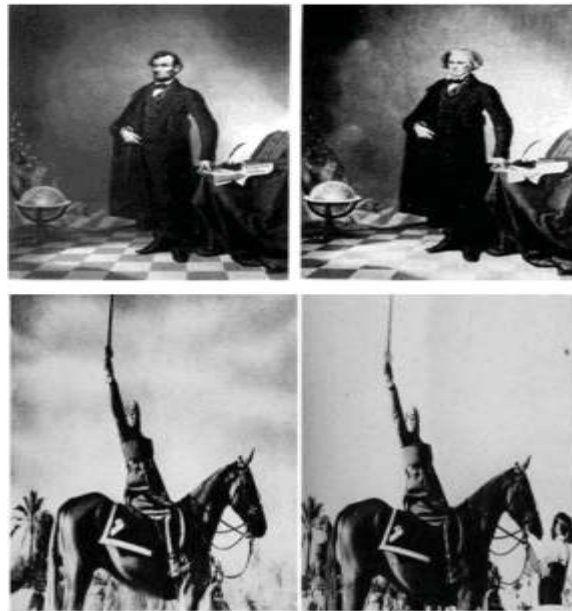
Fig.1 Illustration of typical image forgery

The Image Forgery is a kind of tricky and complex. The detection mechanism needs to be strong enough to comprehend the different types of the Image Forgery. Hence this requires the help of Artificial Intelligence approach. The machine learning mechanisms are high end and robust techniques that can deal with large sets of data to classify them and also are more accurate and precise than the manual methods. This is beneficial in the domain of Image Forensics.