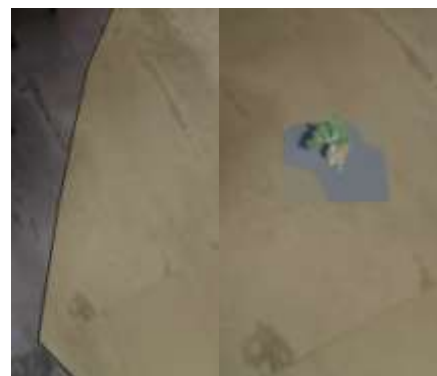
Fig.4 Plane detection using ARFoundation and ARCore in the device

ARCore searches in the scene for groups of key points that can build horizontal and vertical plans, it can also determine the boundaries of each plan.