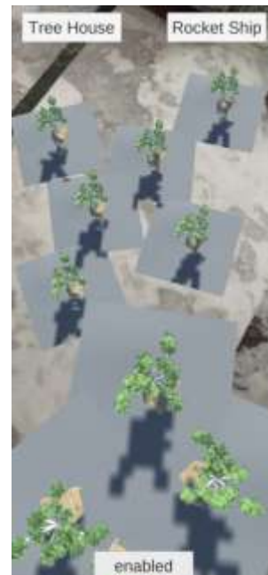
Fig.7 Objects placed on scanned area

From above screenshot we can infer that the size of the screen of the device we are using will determine the area scanned. Therefore these two factors are dependent on each other and thus we were able to place 9 objects within the scanned area. The resolution of the camera will determine the picture quality of the generated object.