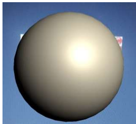
Fig.6 Light estimation using ARFoundation and ARCore in the device

Light estimation in ARCore allows the phone to estimate the environmental lightning conditions and give its user a realistic experience.