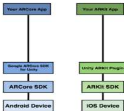
Fig.2 ARCore and ARKit