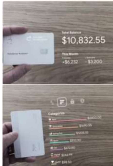
Fig. 9 AR credit Card