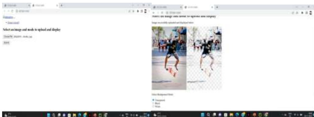
Screenshot 3:Uploading the picture Screenshot 4: Salient image with transparent Background.