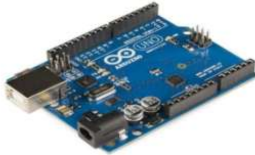
Figure-3:Arduino Uno Board

jack, an ICSP header and a reset button. • Simplyconnect it to a computer with a USB cable or power it with a AC-to-DC adapter or battery to getstarted.