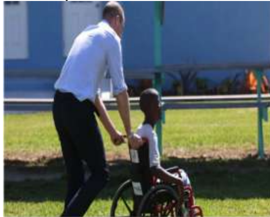
Figure.-1:Manual Pulling of Wheelchair

negative effect on one’s quality of life, which is known to lead to a decreased participation in common daily activities and independence. 3 Among the many aspects of wheelchair configuration and fitment, the seat and backrest upholstery has a large and direct effect on the user’s posture and comfort