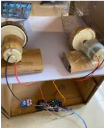
The machine's internal structure includes DC motors, an Arduino mega, and spirals.