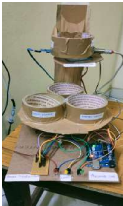
Fig 2: Project Kit