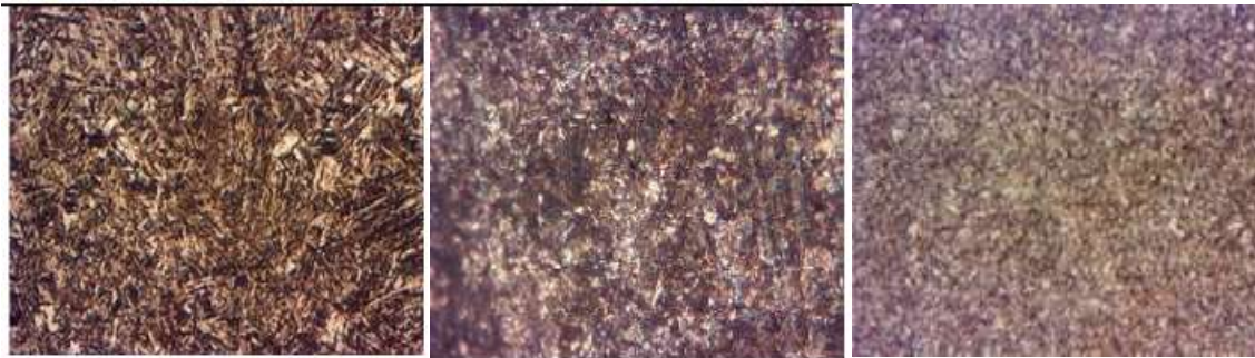
Material Grade- Hardox-400 (Q&T Condition) - Tempered Martensite @100X magnification