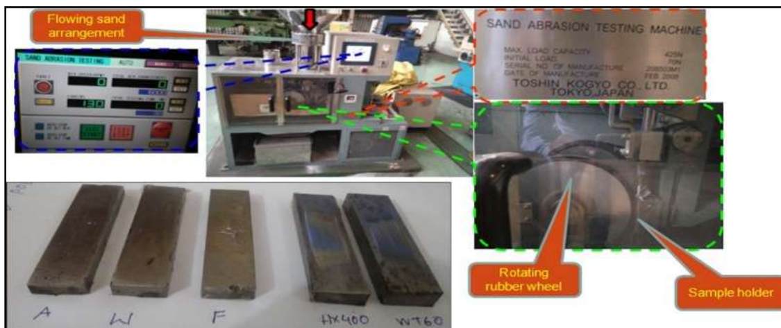
Fig 1- Dry sand- rubber wheel abrasion test machine, ToshinKogaya