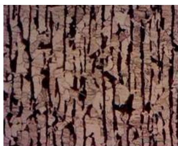
Material Grade-IS 2062 E250BR/SS400 (As Rolled Ferrite & Ferrite) @100X

The following microscope was used to analyze the microstructure of the selected material group. Make-Seiwa, Japan & Carlzeiss with Image Analyser Software (Metalysr Software) Model-SeiwaCorrect and Binocular inverted 35 (Fig 3).