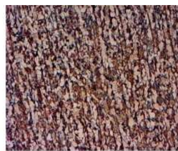
Material Grade-IS 2062 E450/HT-60 (Uniform Pearlite & Ferrite) @100X