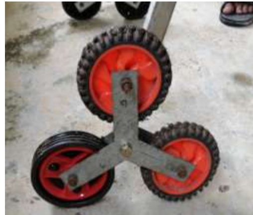
2. wheel Setup