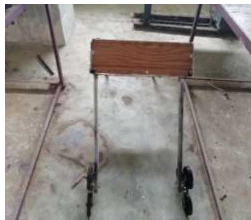
4. Front View