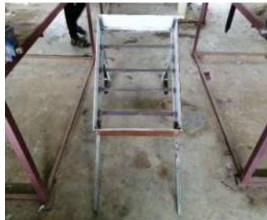
3. Chasis Frame