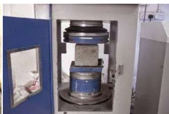
Fig. No. 4: Compressive Strength Test.