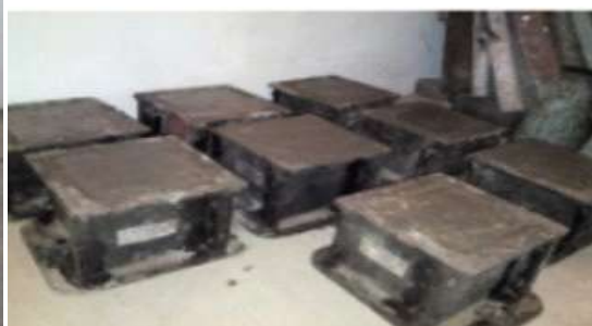
Fig. No. 2: Casting of Specimen