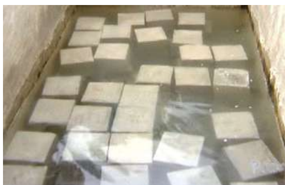
Fig. No. 3: Curing Cubes