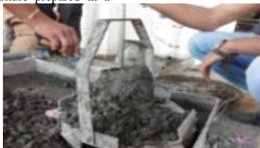
Fig.No. 5: Slump Cone Test.

laboratory or construction site. The slump value of concrete is only the principle of gravitational flow on the surface of the concrete cone, which indicates the amount of water added, which means how this concrete mixture is in working condition.