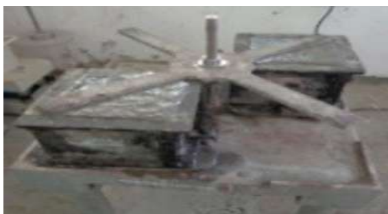
Fig. No. 1: Compaction of Mould on table vibrator