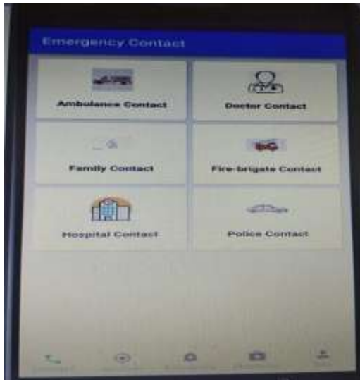
Fig-2: Emergency Buttons

In this login pages there two buttons one for Log in and another one for Sign up. If you already have an account then only you can click on login button rather than you have to create account on this application.