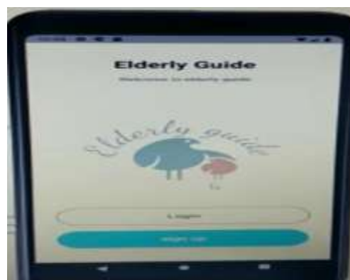
Fig -1: Loginpages

In this application there is two options if you are child then you can fill your information as child so you can easily track your parents location and if you are parents then you have to login or set your information as parent.