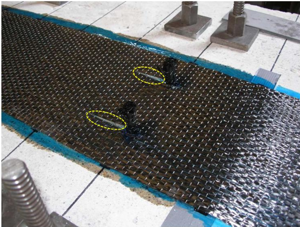
Figure 7.1 — FRP Sheet Openings behind FRP Anchors

FRP anchors with a large splay diameter are more susceptible to the delamination failure mode since the anchor must transfer the force generated over a large width FRP sheet into the concrete substrate. In order to prevent the delamination failure mode observed during the failure of specimens with 4-inch (10.2 cm) splay diameters, it is believed that placing an additional transverse FRP sheet FRP over the FRP anchor splay region following impregnation of the FRP anchor splay would help prevent delamination between the FRP anchor splay and FRP sheet interface.