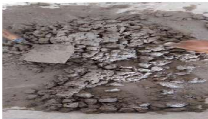
Figure 4 Concrete Cubes with Mould