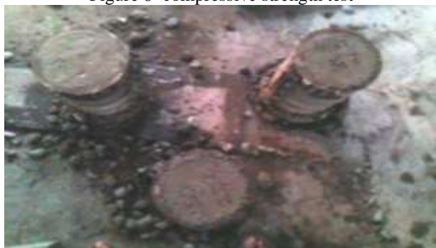
Figure 9. prepared cylinder