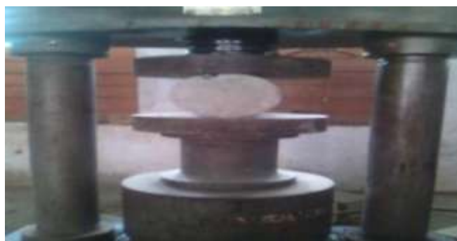
Figure10 split tensile test