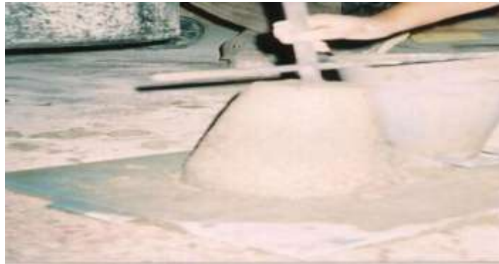
Figure 5 Slump test

To measure the workability slump cone test was performed. The dimensions of cone are (i) top portion is a truncated cone having a size of 200 mm diameter at the bottom and 100 mm diameter at the top with a height of 300 mm. As soon as concrete is prepared, it is placed in the cone in three layers with 25 times of tamping each layer. The cone is then lifted up gradually and the fall in height of the concrete is measured, indicating the slump of the mix.