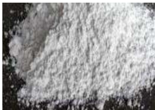
Figure 2 Marble powder

The physical and chemical properties test are done is shown table 2 and table 3 respectively. Concrete Mix Design