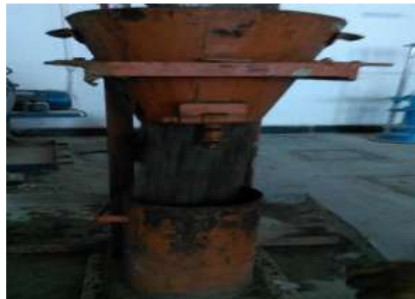
Figure 6 Compaction Factor test

This test was performed to get the workability of concrete. Concrete sample was placed gently in the upper hopper to its brim using the hand scoop and levelled. Trapdoor was opened at the bottom of the upper hopper so that concrete falls into the lower hopper. Trapdoor of the lower hopper was opened and concrete was allowed to fall into the cylinder below.