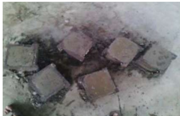
Figure 3 Mixing of concrete

After that cubes were de-moulded with consideration so no edges were broken and were put in the curing tank at the suitable temperature for curing. The 27 0 C was the room temperature while casting. After de-moulding the screws were loosed, cubes and cylinders were allowed to dry for one day before putting them in the temperature controlled curing tank for a time of 28 days.