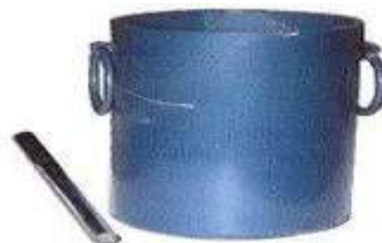
Figure 7 Bulk Density Apparatus

All excess concrete was then cleaned from the exterior and filled measure jar was weighed (W). Density of Concrete (W1) was calculated by dividing the weight of fully compacted concrete in the cylindrical measure by the capacity of measure in \text{kg/m}^3 . Length of mould is 29cm and diameter is 16cm hence volume was calculated to be 0.006\text{m}^3