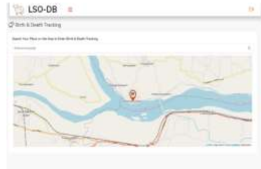
Owner Livestock Tracking Through GIS

Livestock life span is all about tracking of their birth and death details. This page first get the place information through the map search which uses algalia API. By choosing the place on map the list of owners located on that area will be gathered from the backend, so they easily pick the owner and then enter the details of their livestock birth and death.