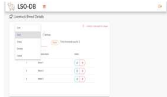
Breed Entry According To Livestock