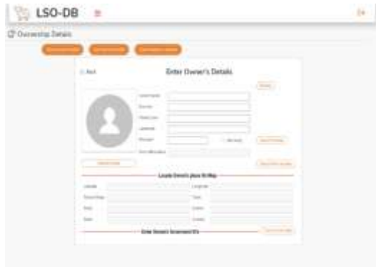
Owner Detail Form