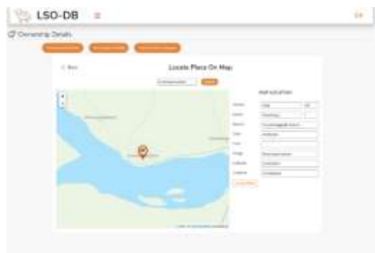
Owner Location Though GIS

The owner's livestock tracking is with main two fields which comes from the master database. Those fields are livestock and livestock breeds information. This page collect the livestock and their breed count. The owner can add as many as livestock and their count.