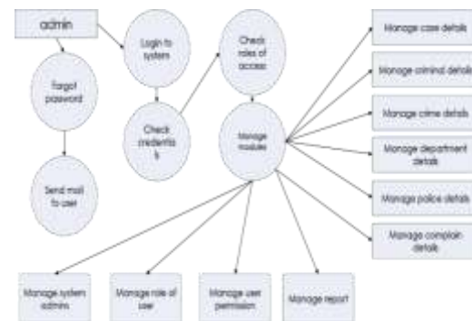
Fig 1 – Block Diagram for application