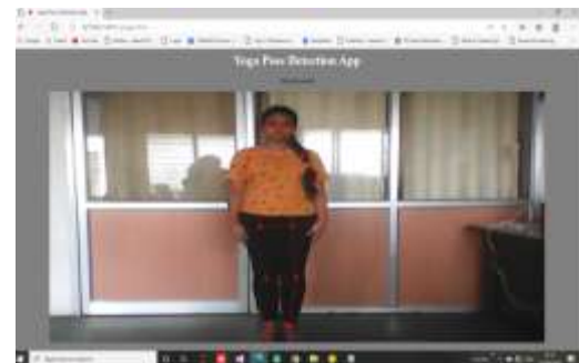
Fig. (d). Pose detection