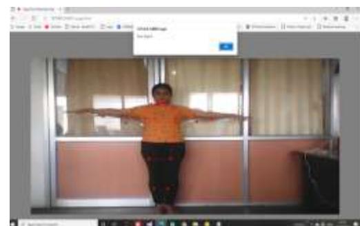
Fig. (e). Pose match