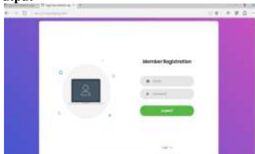
Fig. (b). Registration page