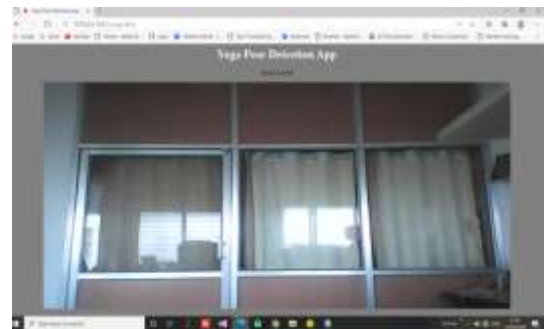
Fig. (c). Model loading