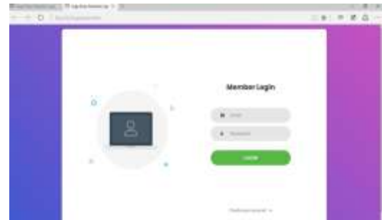
Fig. (b). Member login page