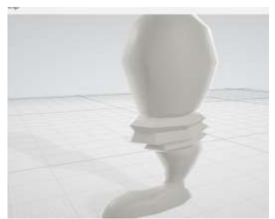
Figure 1: A mannequin fixed with the load cell.

B. Default force calculation: A wearable load cell will be exactly placed at 56 degrees from the flexion point of the knee. Since the knee is the major bone site, the force acting on the legs will not cross the joint. The person will be asked to stand and the force acting and reacting will be measured followed by work calculation. The load cell will be fixed with the display monitor.