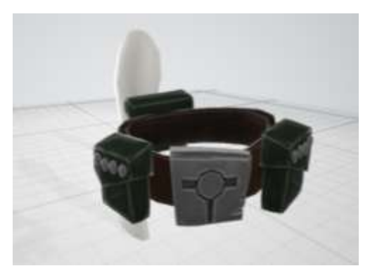
Figure 3: CAD assumption of how the wearable load cell will look like.

C. Positioning the piezo: Once the default force is calculated, it will be categorized or tuned inside a tuner. The piezo will be placed in those areas of the shoes where the default force is acting the maximum. For example, if a person's default force is acting its maximum in the ankle region, the lining is placed there. The limit of the method is that it works only when the patient is wearing shoes with a higher stem. The following is the table that shows the various angles in which the piezo can be placed. The position of the piezo depends on the flexion rate or the extension rate exerted by different parts of the leg. This flexion rate will be responsible for the momentary force exerted by that region.