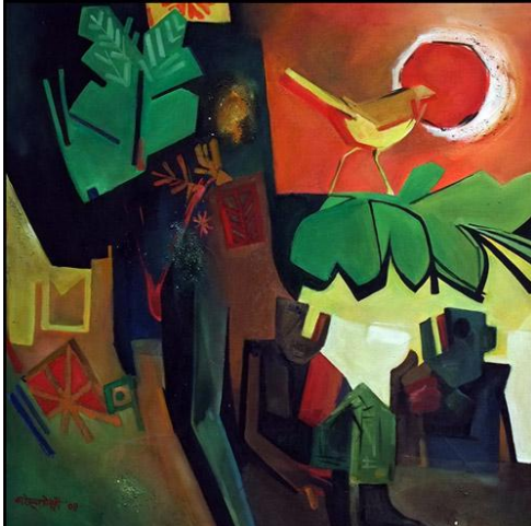
Title: Kites [9] Artist: Qayyum Chowdhury Size: 24" X 24" Medium: Oil On Canvas Year: 2004 This Painting has preserved by Athena gallery