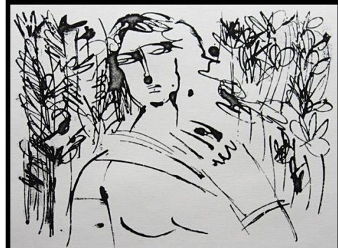
Title: Women [11] Artist: Qayyum Chowdhury Size: 6" X 8" Medium: Etching Year: 2011 This Painting has preserved by Athena gallery

This painting has preserved by Athena gallery