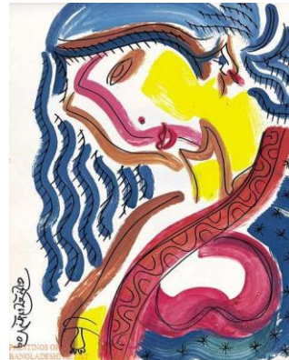
Collector International Center for Arts a contemporary art gallery [13],[14]

Qayyum Chowdhury has been ruling the art arena of Bengal for the last six-decade, since the era of the early 50s. As a renowned painting talent of the subcontinent, observing his above paintings we have seen his apply of Bold lines, geometric blocks, and variegated strokes and dabs of vibrant colors, including red, green, yellow, blue, purple, white, and black. He has often dominated the abstract expressionist settings with a deep sense of patriotism and down-to-earth modesty. In his work, the artist has used a variety of themes and topics in his artworks most of which have included typical Bengali settings of rural landscapes and beautiful scenic backdrops. The lush greenery of Bengal has always been the preferred choice of artist Qayyum Chowdhury with boats, rivers, sky, birds, tree lines, and semi-realistic figurations of common village folks including fishermen, farmers, and communities of skilled craftsmen[16].