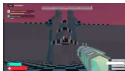
Figure 7. First Person POV IV