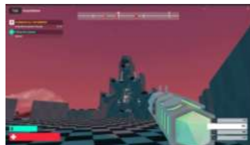
Figure 5. First Person POV II