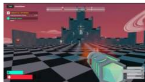
Figure 4. First Person POV I