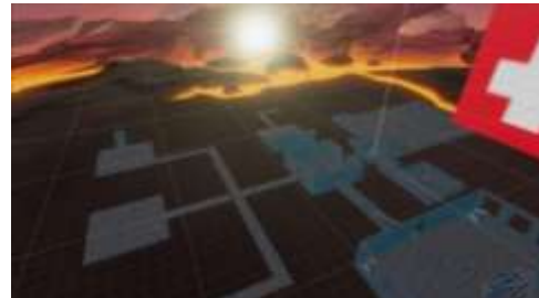
Figure 3. Map Overview