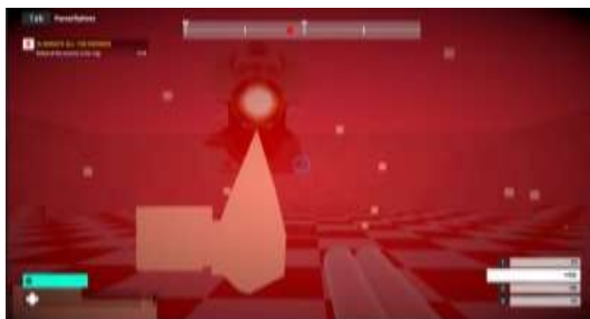
Figure 11. After Defeat Interface