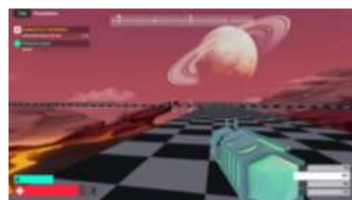
Figure 6. First Person POV III