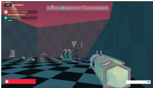
Figure 9. Equipments