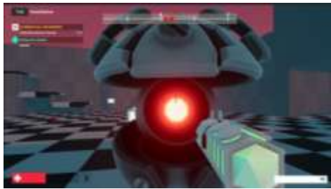
Figure 8. Enemy Bot