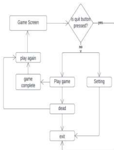
Figure 1.Flow of FPS Application System

The working of our project can be explained in the following manner: The user interface will be typically divided into two sections: the “main menu” and the “in-game” areas. The user interface will be simple, quick and easy to process. The main menu will present a title screen to the user and allow the user to choose between starting the game and viewing the setting panel, which allows changing of the video and audio settings. Once the user clicks the “start game” button on the main menu, the game will switch to the “in-game” user interface. Upon transition to the in-game user interface, the player object and the environment will be displayed. The user will control the player throughout the game by using the keyboard and mouse. For the in-game interface, a “health bar” will be displayed on the screen and will represent the current health of the player. [6]