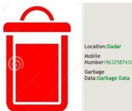
Fig 3: Example 3 The Arduino serial monitor showing the garbage level is at 10cm.

garbage level is 10cm. The value is displayed on the Arduino serial monitor window and then the data is transmitted to the web page via Wi-Fi module.