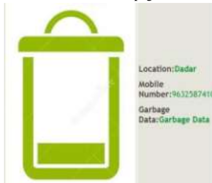
Fig 3: Example 1 The Arduino serial monitor showing the garbage level is at 24cm.

If the trash thrown in the bin is very less or little there will be huge distance between the sensor and the trash as the amount of trash is less and is measured in cm (centimeter), here in the below example the garbage level is 24cm. The value is displayed on the Arduino serial monitor window and then the data is transmitted to the web page via Wi-Fi module.