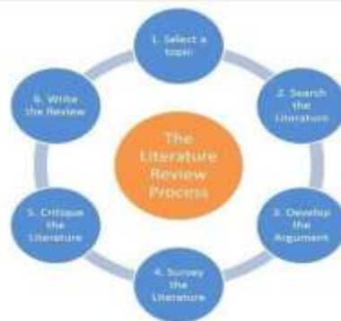
Fig 1: Process of Literature Review.

satisfied and requirements are met, then the next step is to determine which operating system and language can be used for developing the tool. Once the programmers start building the tool the programmers need lot of external support and accessories. This support can be obtained from senior programmers, from books or from websites as references. Before building the system all the above points are taken into consideration to the account for developing the proposed system. Hence, it is very important to have a proper literature survey done before going ahead with any of the project work. Below lists some of the surveys that have been performed in order to obtain the results.