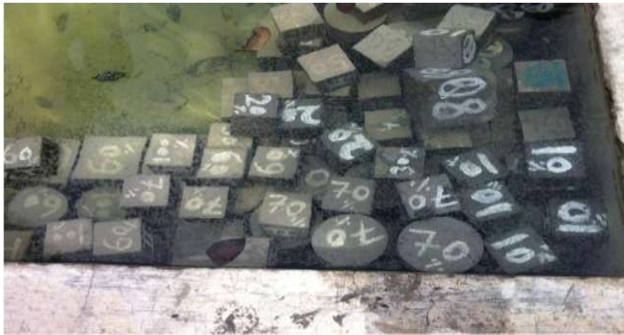
Fig -1: Curing of Test Specimens