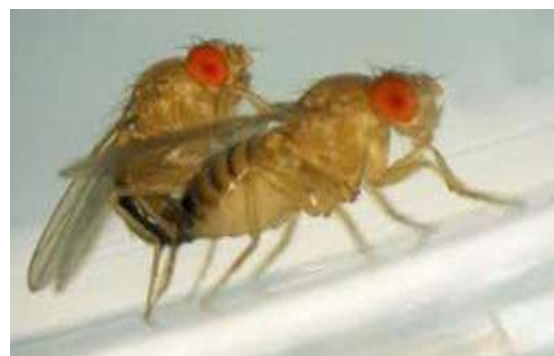
Sex combs in male fly

When metamorphosis is complete, the adult flies emerge from the pupa case. They are fragile and light in color and their wings are not fully expanded. These flies darken in a few hours and take on the normal appearance of the adult fly . Upon emergence, flies are relatively light in color but they darken during the first few hours. It is possible by this criterion to distinguish recently emerged flies from older ones present in the same c bottle .They live a month or more and then die. A female does not mate for about 10 to 12 hours after emerging from the pupa. Once she has mated, she stores a considerable quantity of sperm in receptacles and fertilizes her eggs as she lays them. Hence, to ensure a controlled mating, it is necessary to use females that have not mated before. These flies are referred to as virgin females.