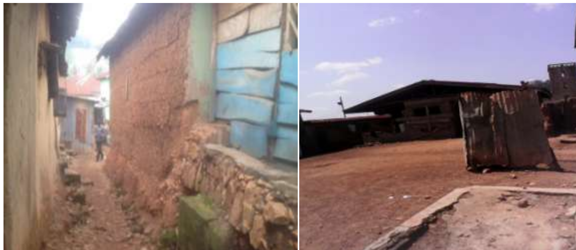
Fig 3: Housing Condition of the Study Area

Likewise, most of the buildings particularly at Irona and Igbehin depend on detached kitchen and made no provision for modern toilet facilities. see All these are also in line with an earlier study by [27] which identified shortage of infrastructure and essential social services, decrepit or dilapidated buildings,