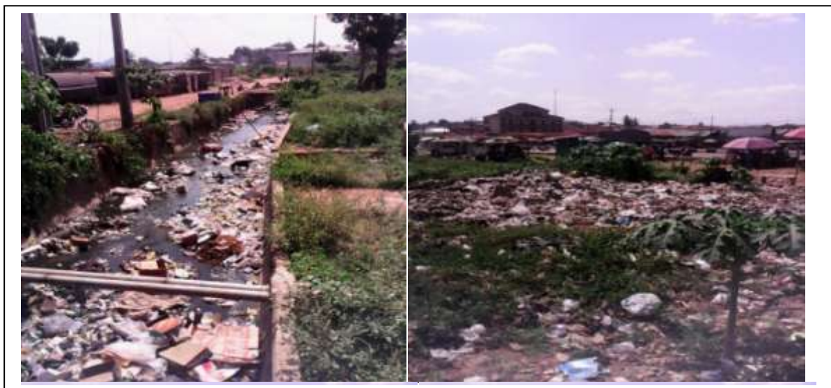
Likewise most of the residents at Irona

overpopulation and unhealthy living conditions as the basic features of slum areas At the same time These living arrangements have serious health implications on the lives of the slum inhabitants by exposing them to different kinds of ailments and diseases such as meningitis, asthma, cholera, diarrhoea, malaria among others[28].