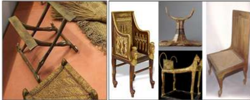
Fig: Examples of Neolithic era & Ancient Egyptian furniture.

functional furniture, with only a few wooden pieces such as reed chests or wooden pegs to store things on the walls.