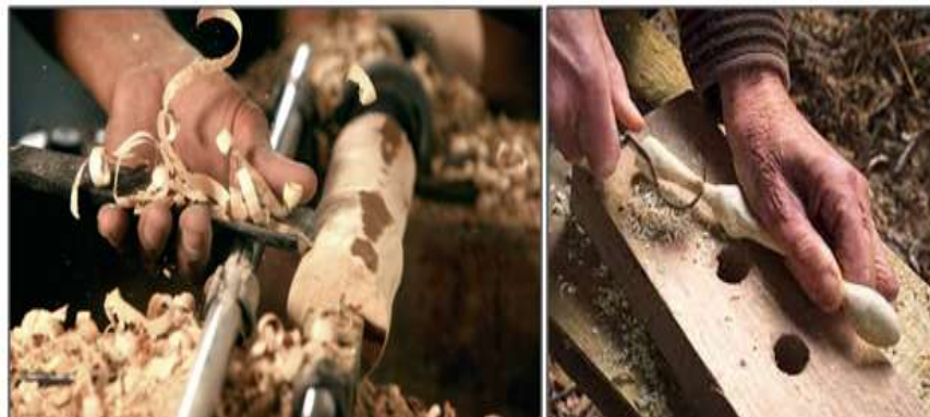
Fig: Use basic hand tools to build fine furniture

the historical process of human civilization, wood is not only a kind of material that exists but also a civilization symbol with the natural ecological material as the carrier. It has survived thousands of years and has been condensed as a unique wood value with the advancement of human living standards. There are main two aspects that can help us understand the condition of wood in furniture design: firstly, for the culture, the basic conditions of any things being culture include two: firstly, mental activity and material carrier, and the attribute of wood conforms to the conditions. Secondly, in terms of cultural ecology, wood culture is a secondary cultural system-using wood is the tie to connects social culture, aesthetic culture, architecture culture, and living culture together, forming a mesh natural material culture system, with other cultural systems of wood as a wrap and the wood material properties and spiritual attributes as weft.