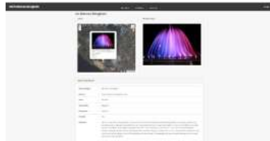
Figure11. Detail information

display information about the name of the tourist location and show action buttons for details and route to the tourist location. The popup page can be seen in the above picture 10.