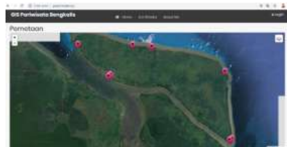
Figure 7. User Interface Display Page in Satellite Mode.

The home page for users displays a map that has been marked with tourist location. If the user wants to view information about the marked location, the user can simply click on the marker on the map. The user's home page has three different map views: satellite mode, streets mode, and grayscale mode that can be changed when the user clicks on the base map layer menu in the right corner of the user's display. The user's home page with satellite mode, streets mode, and grayscale mode can be seen in Figures 7, 8, and 9.