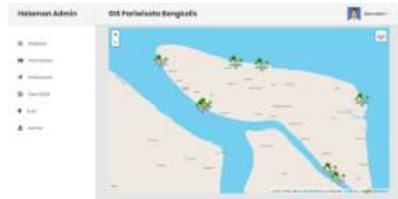
Figure 5. Admin Home Page

The admin home page can be accessed after the admin successfully logs in. The admin home page will display menus to manage the website and display the inputted tourism locations in the form of maps. The admin home page can be seen in Figure 5.