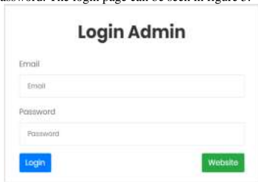
Figure 4. Login interface

Page login is used by the admin to access the admin page within the application. To be able to login, the admin needs to enter their email and password. The login page can be seen in figure 5.