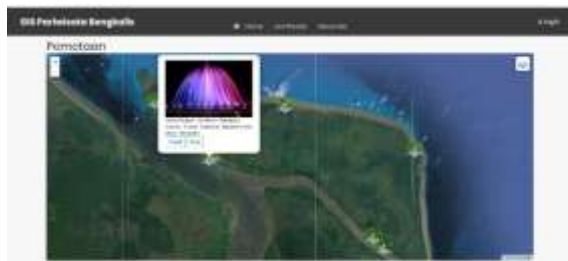
Figure10. PopUp interface

The popup page will appear after the user clicks on the marker on the map, the popup will