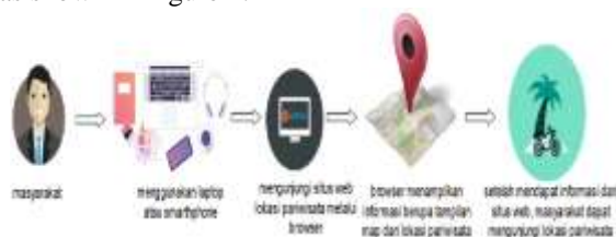
Figure 1. System design

The result of the current system analysis is not effective enough due to the lack of information on the existing tourism locations in Bengkalis Regency. The following is the system that will be developed, as shown in Figure 1.