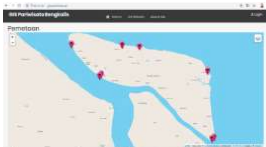
Figure9. Page of User Interface in Grayscale Mode.