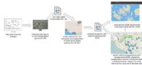
Figure 2. Overall Application Design

The general application design illustrates how the application is built using geojson files until it can be displayed on a website page, as shown in figure 2.