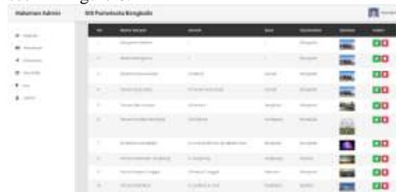
Figure 6. Tourism page

The Pariwisata page displays the data of tourism locations that have been successfully inputted by the admin. The Pariwisata page can be seen in Figure 6.