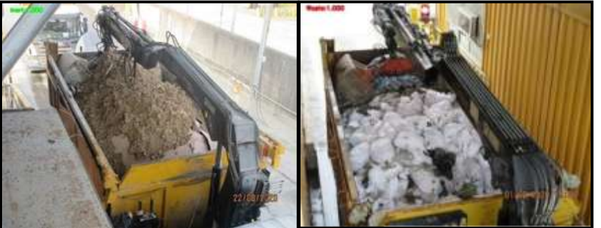
Fig 6: Result Validation for exit material classification detection modules

Secondly, the AI powered cameras are also trained to detect any dump truck with overloading of material to prevent break failures