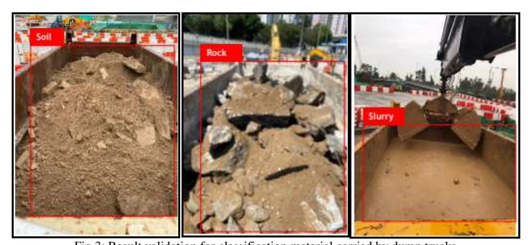
Fig 3: Result validation for classification material carried by dump trucks

powered cameras are trained well to identify the material it is carrying through soil classification module which efficiently bifurcates material carried by dump trucks into soil/slurry/sand slurry or other materials.