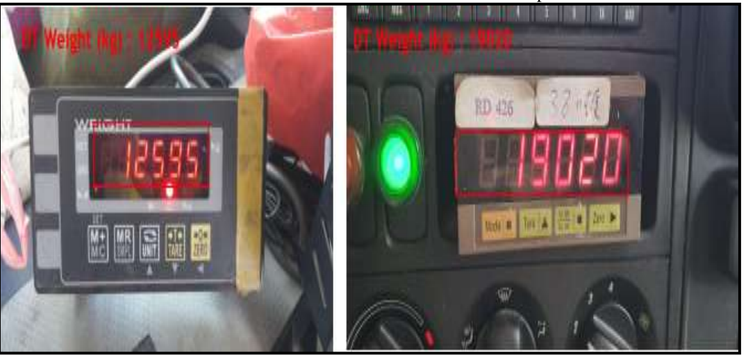
Fig 7: Validation Results for Dump truck overload detection module

the waste classification module to detect material carried in the dump trucks before their exit.