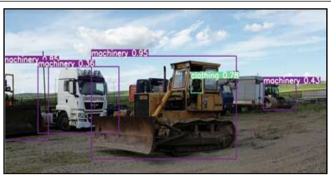
Fig 4: Result validation for dump truck loading-unloading cycle at job-site

Volume 3, Issue 8 Aug 2021, pp: 180-186 www.ijaem.net ISSN: 2395-5252