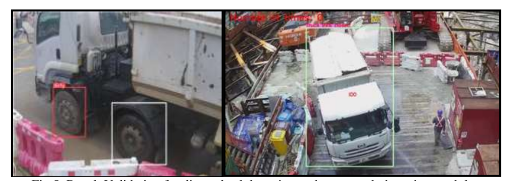
Fig 5: Result Validation for dirty wheel detection and open truck detection modules

dump truck cover detection and dirty wheel detection module, it is made sure that any dump truck is not let to leave without cover or dirty wheels. Apart from this to maintain hygienic dump truck operations the system also allows detection of the road cleanliness to prevent any construction trash sticking to wheels.