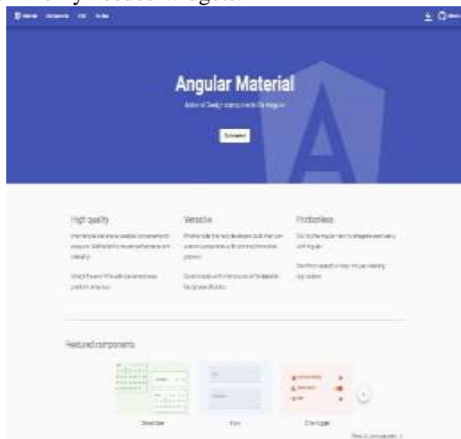
Figure 5: Angular material

Angular by itself is a tremendous framework that alongside the Angular CLI makes our life as developers simpler than ever. But imagine what it might mean if adopting this new framework would mean also that we might need to write manually our own form controls as well: like for example date pickers, dropdowns and other commonly needed widgets.