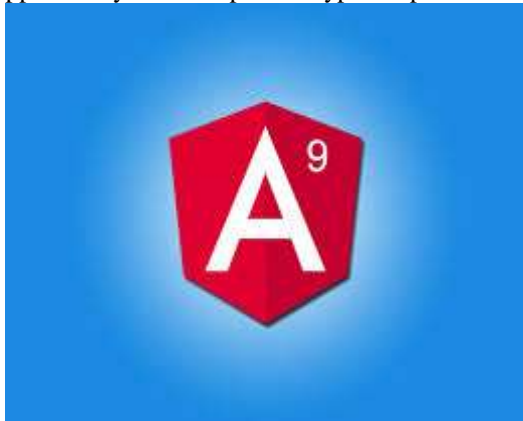
Figure 1: Angular 9

team works hard and Dedicatedly maintains Angular, so API will not need to change like as before in Angular 1 & 2 we have faced drastically change in API. That's an excellent thing, which keeps up-to-date the items with the simplest practice and advanced features supported by JavaScript and TypeScript