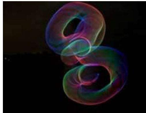
A STRING CHANGING ITS VIBRATIONAL PATTERN

So time can be traversed if the frequency of the vibration of the strings can be calculated and thus using an same frequency of opposite phase to stop to dampen the vibration to break the attraction between the string and the time fabric on in which it is vibrating.