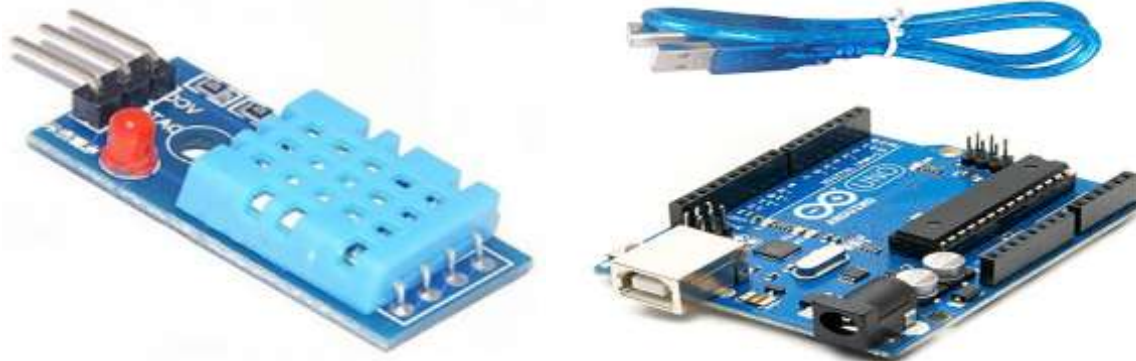
Diagram of Arduino and DHT11 Sensor

operator monitors room every month in order to ensure the cool temperature. In this research, a system that can monitor the temperature and humidity of the PoP room directly anytime and anywhere is proposed. This monitoring system is based on the microcontroller and the web service. The proposed system will make monitoring PoP room becomes much easier and effective. [5] In order to ensure that the server's performance is not impacted by excessive room temperature and humidity, real-time monitoring of the room's temperature and humidity has become essential. Increases in server room humidity and temperature that are unchecked and unregulated could harm equipment. While the Bicubic method interpolates data points on a two-dimensional grid, the Color mapping technique alters the temperature colours of the image collected by the IP camera. When the temperature and humidity in the server room exceed the critical value, the system is designed to send an alarm to the administrator.[6]