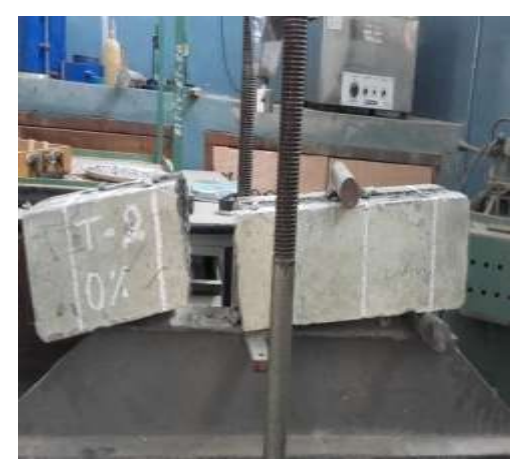
Fig 7. Prism after flexural failure