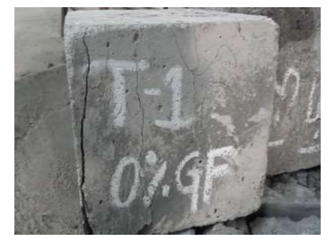
Fig 6. Cubes after compression test