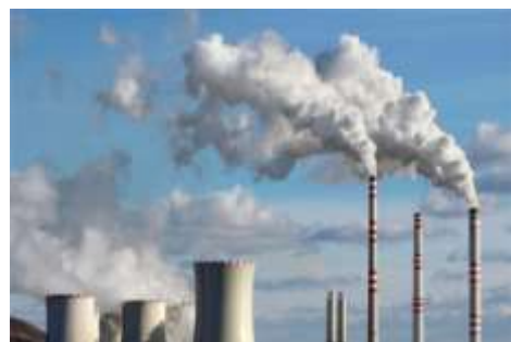
Fig. 1. Earth at risk of 1.5 degrees Celsius warming as CO 2 emissions rise

Greenhouse gases are gases capable of absorbing and reflecting infrared radiation from the Sun, increasing the Earth's surface temperature [5]. Greenhouse gas emissions mainly include CO 2 , CH 4 , N 2 O, O 3 and fluorocarbons. Greenhouse-gas-Emissions are of natural or man-made origin, of which the transport sector is one of the largest sources of emissions.