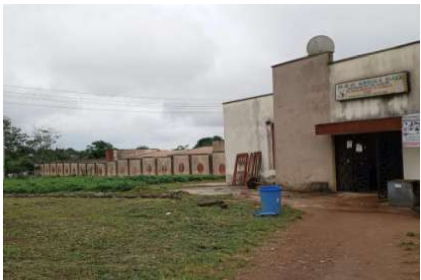
Abiola Hostel without electric wireframe

territoriality, the E.Adeboye Hostel lacks landscape and therefore movement within the large perimeter fencing bounding the hostel is unrestricted.