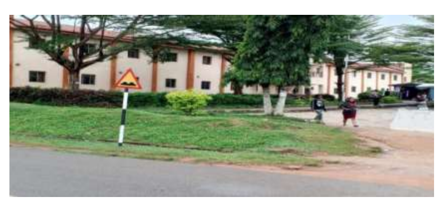
Adeniyi Hostel without perimeter fencing