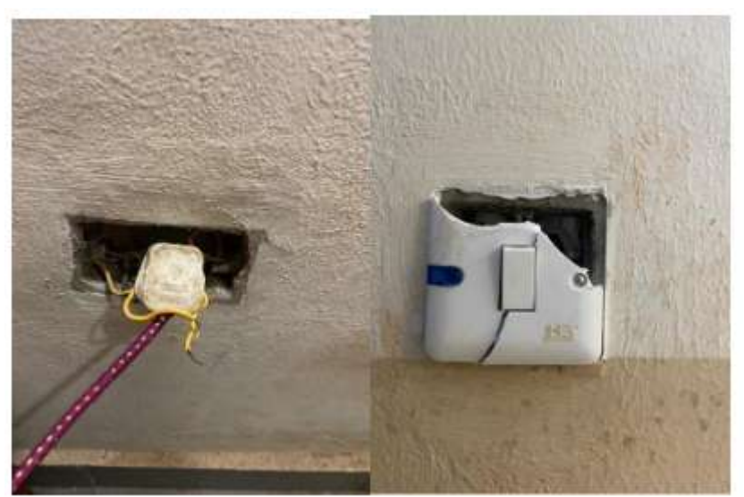
Pictures of showing bad electrical connection and a bad fitting - Akindeko Hostel

and related cooking gadgets and fittings, exposed flames and lights, water heaters, in some cases, chemicals and Liquefied Petroleum Gas (LPG). This is the case in male hostels in FUTA evidenced with open cables, poor socket connection, use of electric cookers in undesignated areas, room to be specific. This is a proof of poor safety practice in the hostel accommodation.