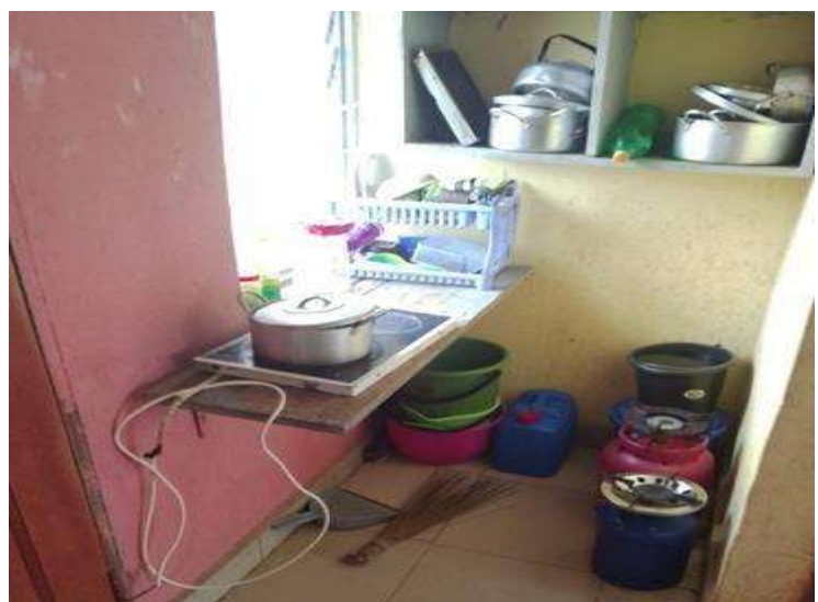
Pictures of showing student cooking in undesignated area.