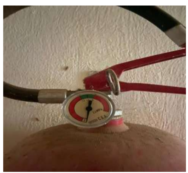
Picture of DCP with indicator below pressure mark

The above picture of the DCP extinguisher was captured at the E.Adeboye Hostel. The picture revealed that carbon powder in the cylinder is not pressurized and therefore will be ineffective at a time when it is needed.