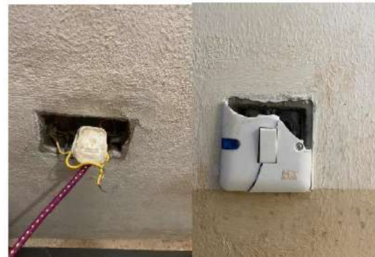
Pictures of showing bad electrical connection and a bad fitting – Akindeko Hostel

Andrew and Martins (2007) stated that common causes of fire outbreaks in university premises, are from electrical appliances, cookers and related cooking gadgets and fittings, exposed flames and lights, water heaters, in some cases, chemicals and Liquefied Petroleum Gas (LPG). This is the case in male hostels in FUTA evidenced with open cables, poor socket connection, use of electric cookers in undesignated areas, room to be specific. This is a proof of poor safety practice in the hostel accommodation.