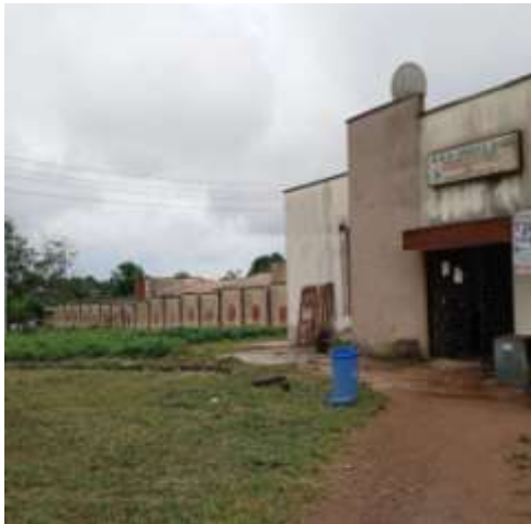
Abiola Hostel without electric wireframe

Owing to the fact that all hostels have perimeter fencing except the Adeniyi hostel, this makes it the only hostel without boundaries. Considering landscape has an effective tool for territoriality, the E.Adeboye Hostel lacks landscape and therefore movement within the large perimeter fencing bounding the hostel is unrestricted.