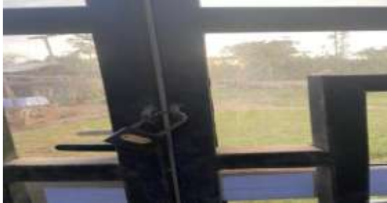
Picture showing a locked emergency exit at the P. Adeniyi Hostel Source: Author (2023)

Fire extinguishers in the students' hostel are observed to be of different types, the DCP –Dry Carbon Powder and the CO 2 extinguisher. A closer look at these facilities revealed that they are not properly serviced and therefore not operational. Fire extinguishers according to standard are designed to be serviced twice yearly (6 Months interval), this is not the case in FUTA hostel as about 85% of inspected extinguishers are due for servicing both DCP and CO 2 .