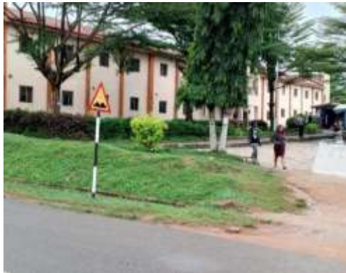
Adeniyi Hostel without perimeter fencing

Owing to the fact that all hostels have perimeter fencing except the Adeniyi hostel, this makes it the only hostel without boundaries. Considering landscape has an effective tool for territoriality, the E.Adeboye Hostel lacks landscape and therefore movement within the large perimeter fencing bounding the hostel is unrestricted.