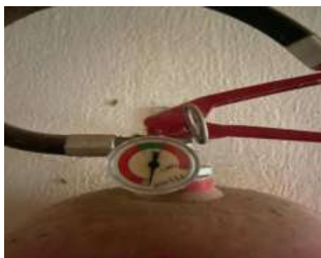
Picture of DCP with indicator below pressure mark

The above picture of the DCP extinguisher was captured at the E.Adeboye Hostel. The picture revealed that carbon powder in the cylinder is not pressurized and therefore will be ineffective at a time when it is needed.