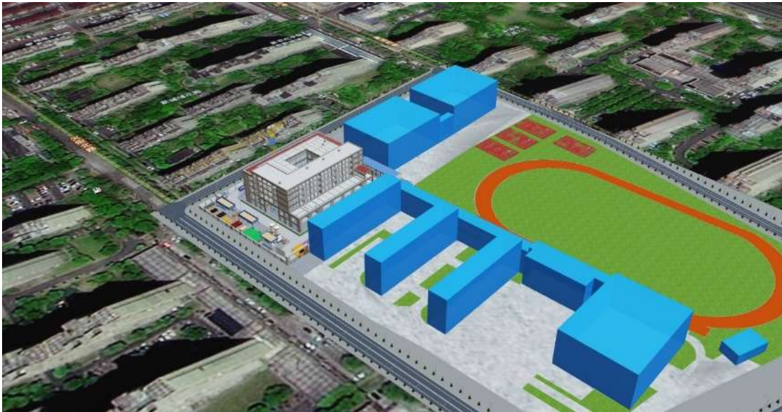
Figure 1: 3D Linkage Effect Diagram of Construction Site Surroundings