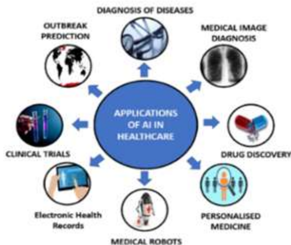
Figure 1: Applications of Artificial Intelligent in healthcare System

In this paper, we are taking a close look at how AI is currently being used in healthcare, where we can improve, and what is standing in the way of making AI a seamless part of the industry. As AI becomes more and more essential in healthcare, we are seeing it make a real difference in everything from diagnosing diseases to developing new treatments and streamlining the way healthcare professionals work. But, we are also facing some big hurdles - like the high cost of getting started with AI, not having enough data, and concerns about keeping patient information safe and private. If we can overcome these challenges, we can unlock the full power of AI in healthcare and make a real difference in people's lives as Figure 1 below show the applications of AI in healthcare system.