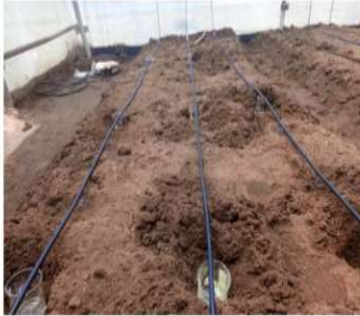
Figure 4: Flow measurement of emitter discharge at pressure head of 1.5 m