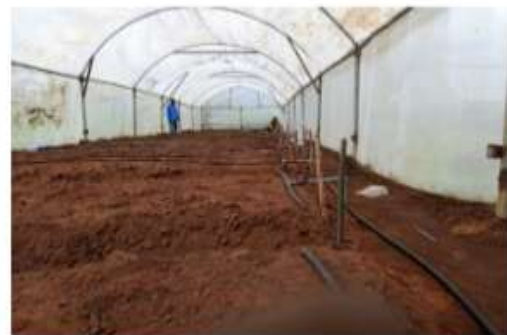
Figure 2: Assembling of system components in the greenhouse

using valved tee connectors. The laterals are connected to the sub-mains by means of elbows and tees. The mainline tee joints and the header tape valved tee connectors were made water tight using adhesive material. However, the lateral tee and elbow joints were made force-fit to facilitate disassembling from the tees and elbows whenever the need arises. The whole system was assembled and set up in the field for testing and technical evaluation of its technical performance characteristics.