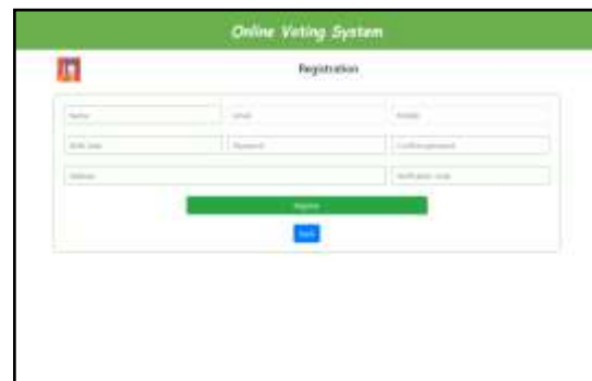
Fig-2: Voter registration page

USER ID and PASSWORD is given to the voter, by using that ID and PASSWORD he\she can use his\her vote. If conditions are wrong then that entry will be discarded.