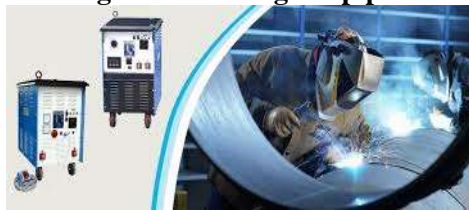
Fig. CO 2 welding for pipes

In CO 2 welding or sometimes electric arc welding the need often arises for welding of circular shape components, where the welding is carried out on the entire periphery or a partial arc length of the job. The electrode is thus moved along this circular path in the conventional method. However, movement of the electrode is much more difficult and it is much easier to index the job. For welding the current work piece Cycle, time is higher .i.e. 45-60 sec. So need to develop such a system for easy work piece loading and & auto welding gun positioning. Auto ON/OFF the switches of welding machine to achieve the smooth working.