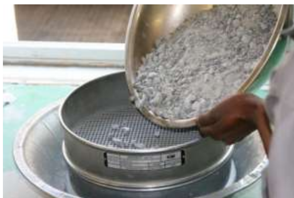
Figure 2: Gradation of WMM