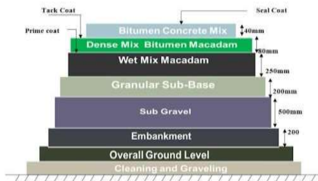
Figure 1: Different layers of Road Pavement

throughout the country. It has also directed towards growth in economy from export and tourism from the world. Also allowing to grow the other transportation sectors. Cheap natural Materials has allowed us to travel world, to take the benefits of transportation and more often with limitless freedom. But as we know everything comes at a cost, multiple problems have emerged with heavy traffic and need of people to travel. Moreover, even though other segments of the economy can trust gradually on alternatives, such as renewable energy sources, there are few substitute opportunities for transport. Economic processes are often tangled with material changes, which bring improvement in construction and economic growth. There have been several changes in past such as use of plastic, use of Fly Ash & GGBS, use of GFRP, Use of Mud Bricks and Limestone Dust. In this Research we'll be dealing with change in granular material to Soil in Wet Mix Macadam. A 100% replacement of stone dust to soil is carried out and tested which also satisfies the IRC Code and MoRT&H Specifications. Tests like AIV, LAAV, FI&EI, MDD&OMC & CBR test has been carried out to testify the Material.