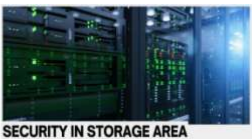
NETWORKS: A TECHNICAL OVERVIEW