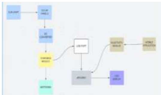
Figure: 1 Proteus Design of project

CIRCUIT DIAGRAM: The photos show the circuit diagrams of display unit and energy conversion unit. We have used Arduino uno, BT module, Solar panels, DC converters, LED matrix, usb cables of type c and micro b pins. Jumper wires, charging module, mobile phones.