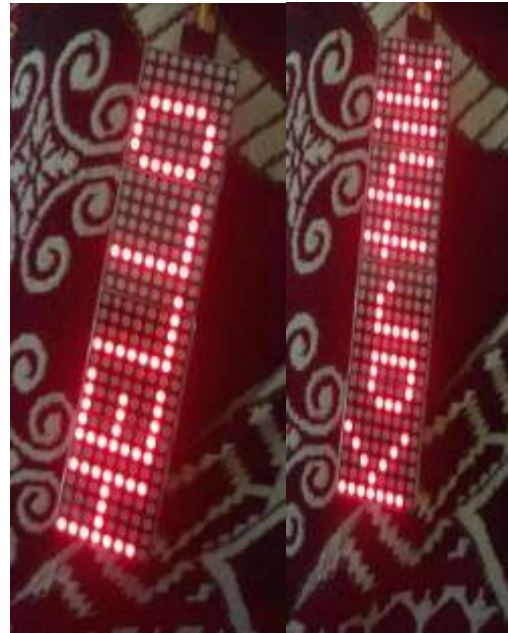
FIGURES 5 &6: SOME RESULTS OF DISPLAYING NAMES USING BT MODULE