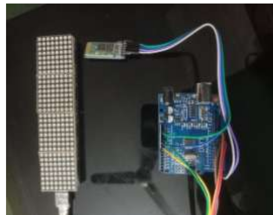
Figure:3 connections between led matrix, Arduino, BT module

EXPERIMENTATION: The aim of the project is to interface an Arduino Uno board with an 8 x 8 LED matrix to display information. Even though a single 8 x 8 LED matrix with corresponding MAX 7219 IC is used in this project, multiple LED matrices can be connected in series for long scrolling display. Connect the components as shown in the circuit diagram. The working of the