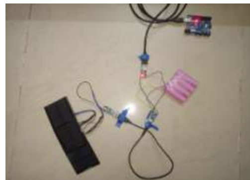
Figure:2 connections from solar panels to arduino

Note: from batteries to Arduino, we can connect it through another dc booster pin and with help of usb cable provided with Arduino we can get power from batteries.