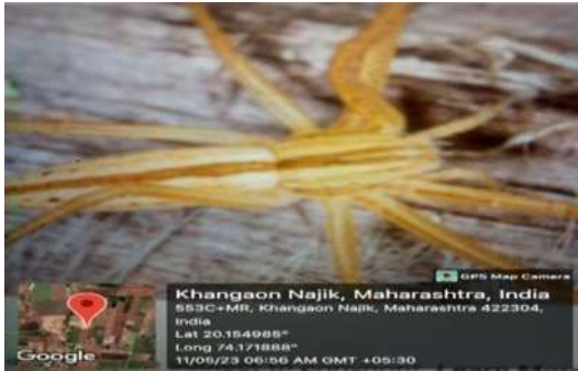
E- Tibellus oblongus