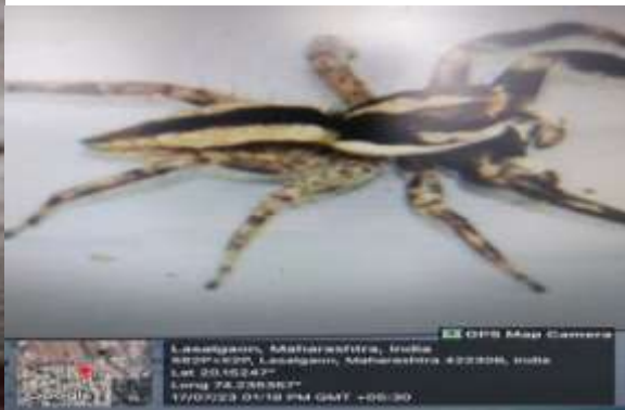
H- Menemerus bivittatus