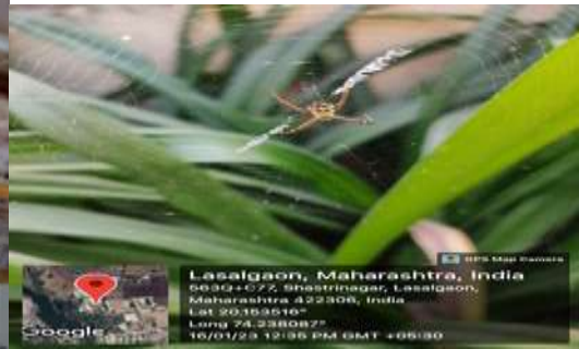
F- Argiope keyserlingi