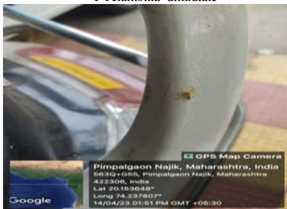
K- Latrodectus geometricus