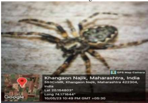
G- Nuctenea umbratica