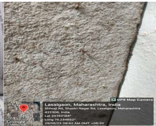
J- Pholcus phalangioides