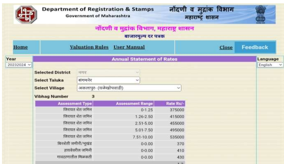
Annual Statement Rate [ASR] Year-2023-24 [Per Hect]