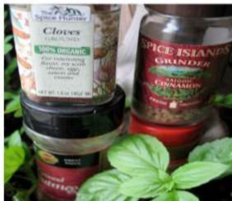
Fig. 1 Pictured are the spices cloves, cinnamon, and nutmeg with a basil plant.