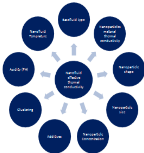
FIG.2 FACTORS THAT AFFECT THE NANO FLUID'S THERMAL CONDUCTIVITY [21].

Miguel Gonzalez et al. in their experiment in 2014 found that, the thermal energy transfer performance of evaporator section decreased, when nano fluid is used at higher power rate, because of the raise in viscosity of the fluid, but the thermal conductivity stoop up at lower power rate. In their work, they found that the raise in viscosity of the nano fluid has a greater influence on the thermal performance of the PHP [4].