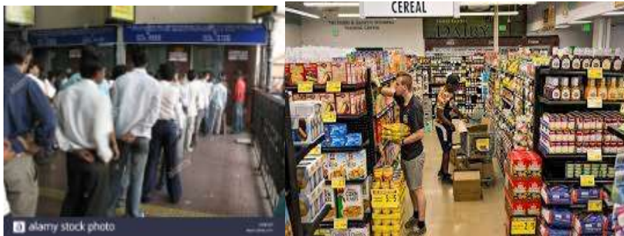
Both are the example of FCFS and SJF cases