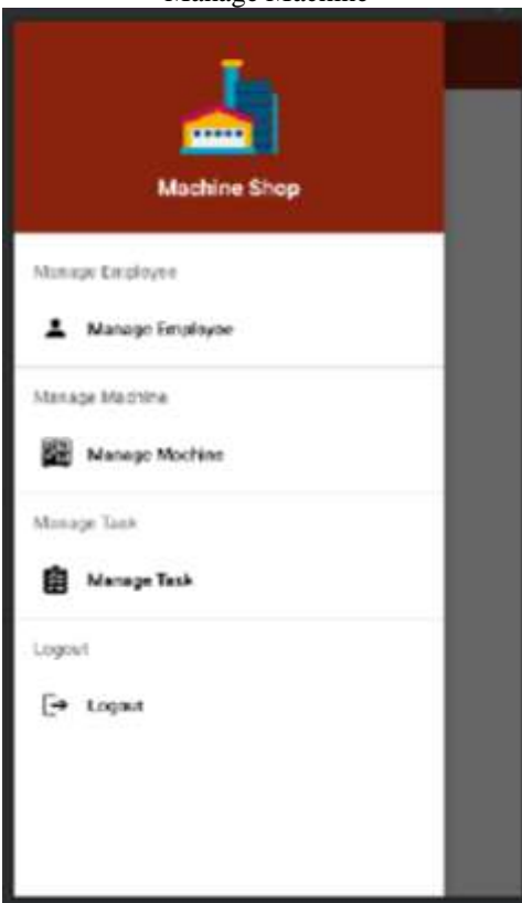
Manager Main Activity