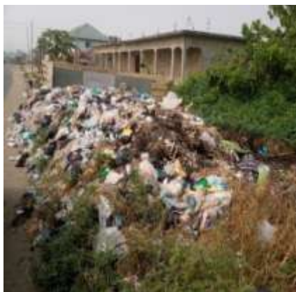
Plate 1: Waste collection center at Eastern-by-Pass, Port Harcourt

the combustion. The waste from these open landfills burns with their soot and the wind sends the characteristic offensive smell to the closer residential neighbourhoods. Of course, residents will inhale it into their lungs as it evaporates into the atmosphere. Plates 1, 2 and 3 show the unsustainable manner of waste dumping, collection and evacuation of waste in the study area.