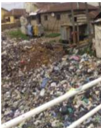
Plate 2: A waste Dump Site at Bundu, Port Harcourt