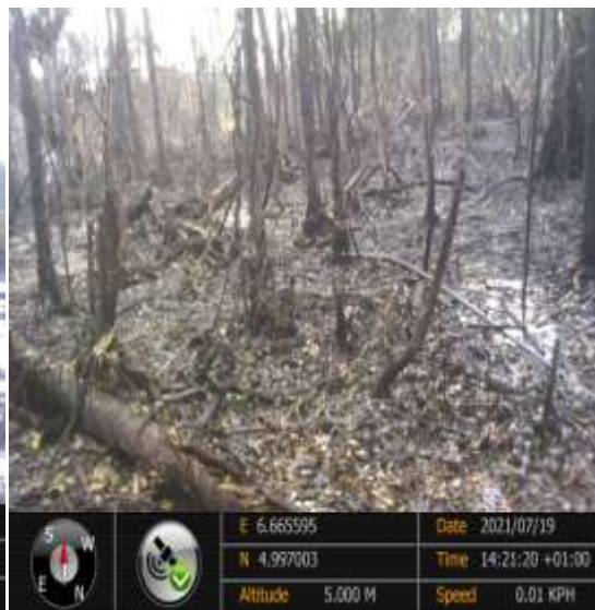
Plate 7: Oil Spilled Site (Kpofire) Elechi Beach Water Side, Port Harcourt