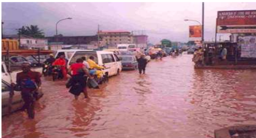
Plate 5: Flooding at Afam Street, Port Harcourt.

Over flown drainages and septic tanks as a result of flooding pollutes the environment and thus make residents vulnerable to different kinds of water-related disease such as malaria, dysentery, cholera, and diarrhea. Trauma resulting from the problem of flooding can lead to non-pathogenic diseases such as hypertension and diabetes. In some other instances, some areas are cut from other parts of the community.