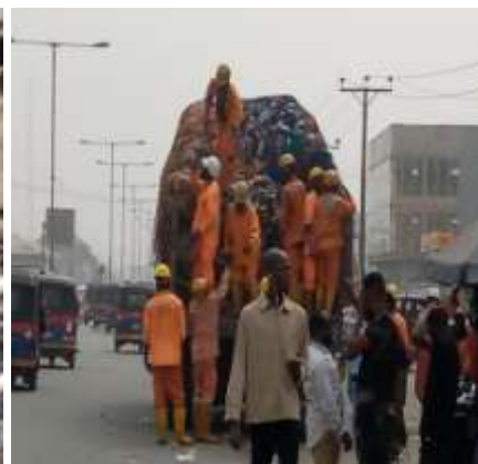
Plate 3: Waste collection methods along Industry Road, Port Harcourt

Vandalizing of oil pipe lines and oil bunkering activities/artisanal refineries operations occur in proximate locations of Port Harcourt municipality. Most of these operations lead to oil spills on both land and sea, and legal and illegal gas flaring which causes both land, sea and water pollution. Liquid pollutants evaporate into the atmosphere, reach condensation point; some infiltrates the ozone layer while others fall back as rain but in this case, acid rain.