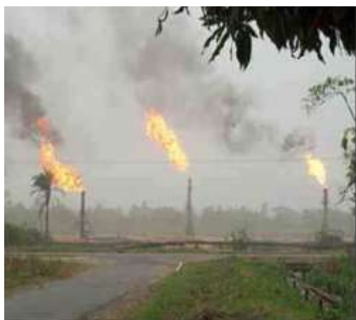
Plate 4: Gas Flaring at Botem-Tai, Rivers State