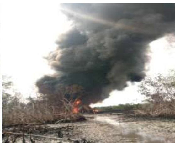
Gas from Burning of Kpofire Station