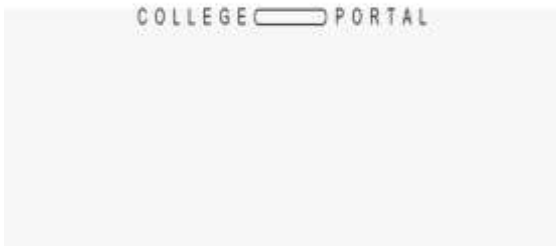
Fig 2: Dashboard of College Portal