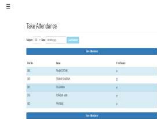
Fig 3: Taking Attendance