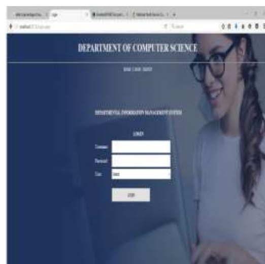
Fig. 1: Login page

Therefore, to solve the above challenges, this research proposes an automation system. With this system the basic information of student results and lecturer's academic data is collected automatically. This system manages the information about various lecturers teaching materials, information about subject's marks obtained by students in different semesters and then generate a final report of each and every student.