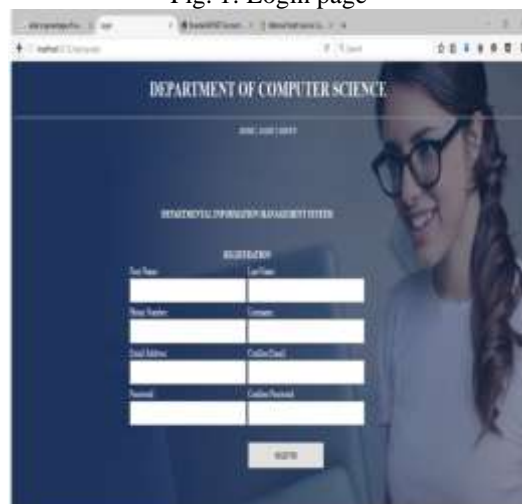
Fig. 2: Registration page