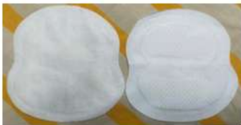
Figure 9 Finished sweat under arm pad

This Underarm pads provide comfort and cleanliness, especially for people with hyperhidrosis or in hot areas, by absorbing perspiration, preventing stains on clothes, and reducing body odor. Caricapapaya is one natural antibacterial that may be used to reduce odor and