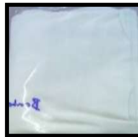
Figure 6 100%Natural Bamboo non-woven fabric

absorbency characteristics, pH value and FTIR test were performed on this completed cloth.