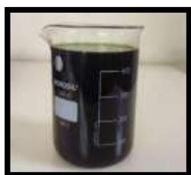
Figure 4Carica papaya