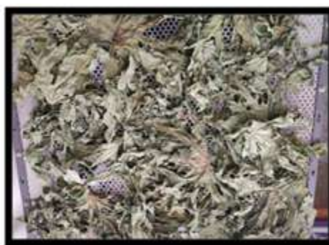
Figure 2 Shadow drying Caricapapayadry leaves