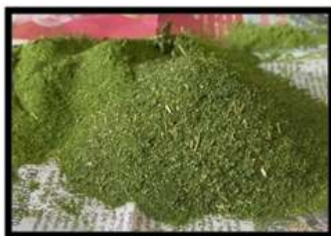
Figure 3 Caricapapayapowder

The choosed herbal part was dry and grain in grinder mixers. Subsequently the dirt and unfriendly particles were eliminated using the sieve, resulting in fine powder. One technique, the solexlet extraction process was used to accomplish the extraction