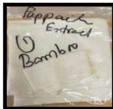
Figure 7Finished 100% bamboo Caricapapaya

The natural herbs extraction is coated with 100% bamboo non-woven fabric using padding mangle method. The extraction is coated with 100% bamboonon-woven fabric. A sample are coated with herb extraction. The finished 100%bamboo non-woven fabric is show below.